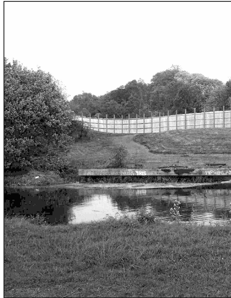
Forth and Clyde canal-side footpath blocked and benches removed. The 5th of May, during an Old Firm match. The area is now the exclusive

redevelopment is 10 years and awaits the £5 billion makeover. We need cheap and simple improvements before someone is killed. Masterplan Shmasterplan! Give us that crossing. Give us pedestrian access from Glenavon to Asda and Summerston station now.