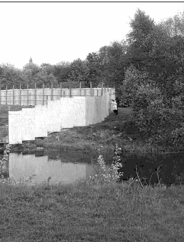
the public space above was enclosed with an 8ft high fence built on ive preserve of the Mondriaan estate in former Ruchill.

ple who now live here. We will be moved out in a reminder of the Highland Clearances. We can see what's coming in the Mondriaan estate, the new houses off Ruchill St, pretentiously named after the abstract Dutch artist Pieter Cornelis Mondriaan, whose Composition with Yellow, Blue, and Red finds a feeble echo in the facades of the houses. The Mondriaan flats have nothing to do with Maryhill, its heritage or its culture, they are for "New West Enders"; and they start selling at £1/4 million.